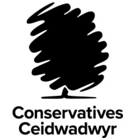
Emblem 3 Welsh Emblem [Emblem Id 7731] Date last change authorised by EC: 30/11/2020