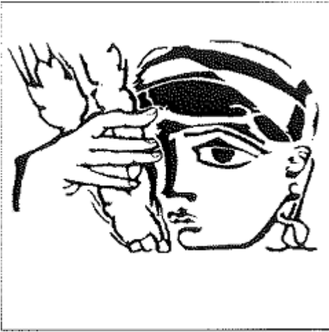
Astraea [Emblem Id 693]

Date last change authorised by EC: 01/02/2012