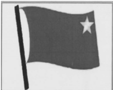
Emblem 3 [Emblem Id 2450]

Date last change authorised by EC: 30/03/2016